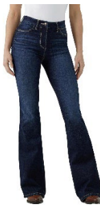
Example of Dark Denim

Interview: Dark denim Western style jeans, white cotton long sleeved button up collared shirt, black or brown boots, black or brown belt with a buckle, and a Cowboy Hat. You may add necklace, scarf/wild rag, earrings, and bracelets of your choice. Your hair should be curled and not pulled back