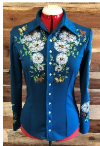
Example of Horsemanship Shirt (shirt made by MelloWorks)

Horsemanship: Dark Denim Western style jeans, Western style shirt, black or brown boots, black or brown belt with a buckle, and a Cowboy Hat. Hair should be curled and pulled back into a ponytail. Spurs are allowed, no chaps or vests allowed.